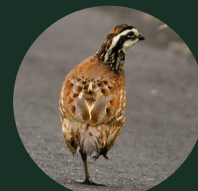
Northern Bobwhite Quail